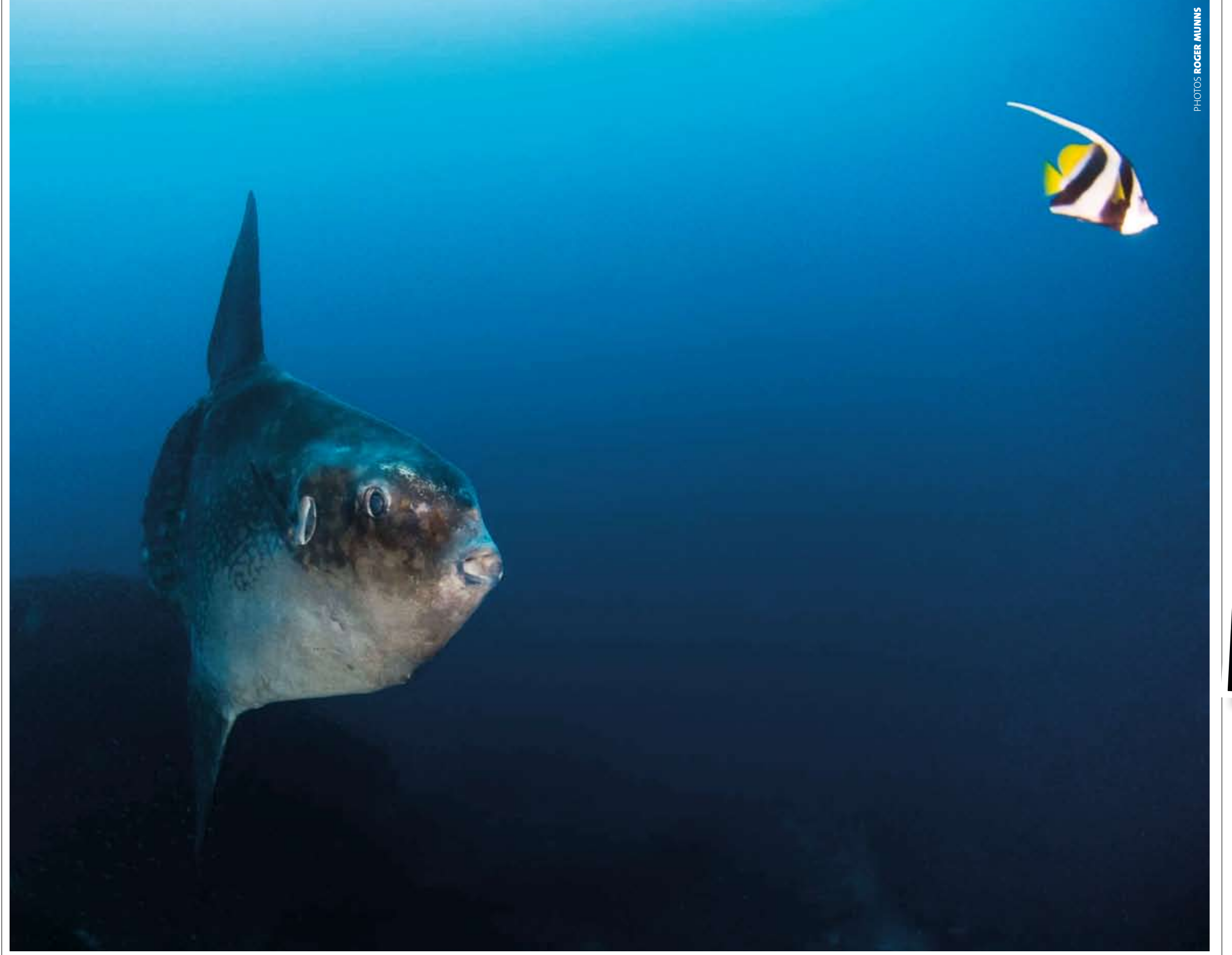
Ocean sunfish (Mola mola) in Bali, Indonesia.

Seeing this daily routine of Mola mola lining up along the reef edge, waiting for their turn to be cleaned by the bannerfish, is certainly high on the list of must-dos for many divers.