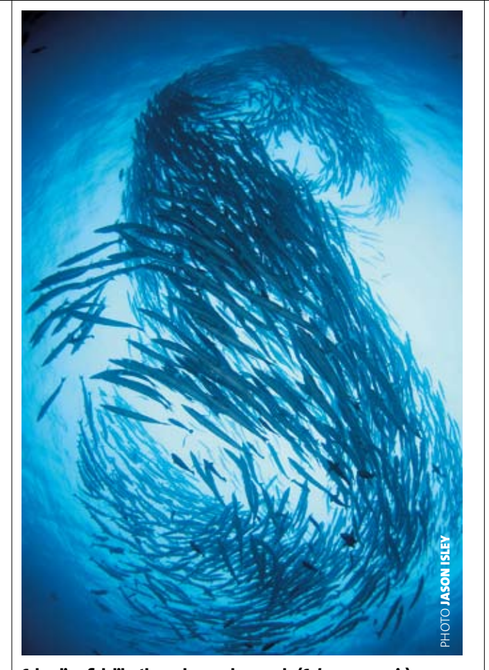
Schooling fish like these chevron barracuda ( Sphyraena qenie ) can form all sorts of elaborate shapes, Sipadan, Sabah, Malaysia.